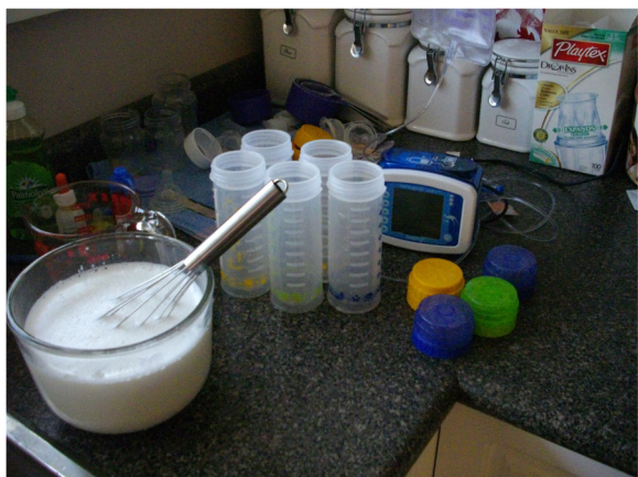
Fig. 2 Health Supplies

these decisions required acquiring considerable medical knowledge and training. As well, the training involved learning to adjust to the changing dynamics of the child's condition. For example, a mother of an older adolescent explained that she and her husband were always tweaking her son's medication because he is growing and changing. Although parents acknowledged the importance of assuming the multiple health professional roles, they voiced that acting as a health professional was challenging and "scary."